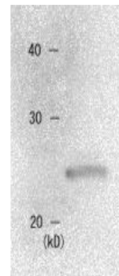
Fig.2 Identification of HP1 \beta by Western blotting with the antibody in the crude cell extract.

Cells were fixed with para-formaldehyde. The second antibody was Alexa Fluor 594-conjugated goat anti-rabbit IgG.